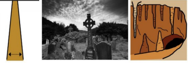
A narrow, gloomy