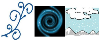
A swirling, whirling