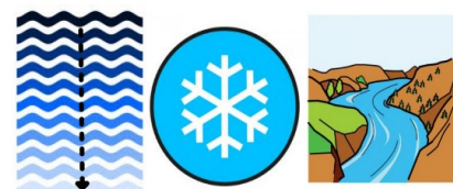
A deep, cold