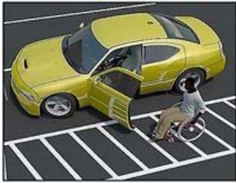
Parking and Passenger Loading Zones