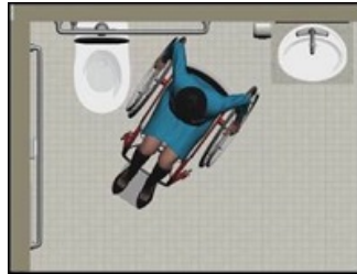
Accessible Toilet Rooms