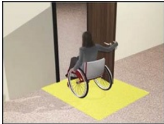
Maneuvering at Doors