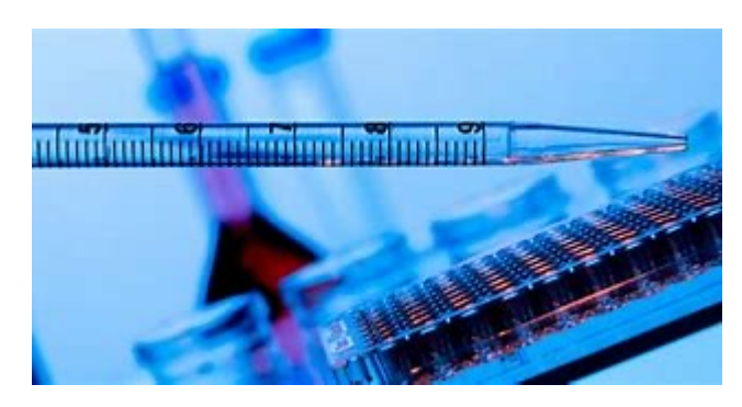
From France genomique 2025

Since 2006, new technologies have made it possible to discover the properties of many bacterial species in these ecosystems