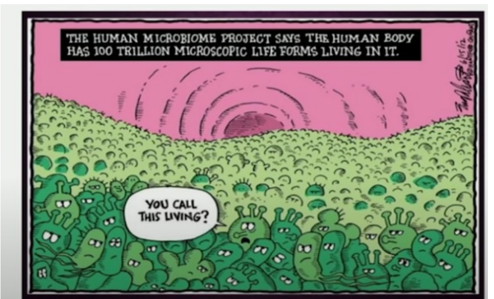
From the Benioff Center for Microbiome Medecine

At the European level, the European regulatory agency (EMA) has developed tools to promote therapies and technologies related to the microbiota.